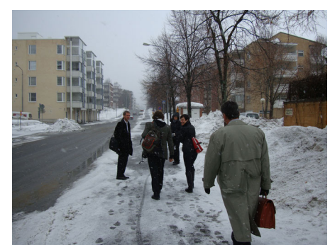
Walking to work in Kuopio

Details on these corridors, on the Key Performance Indicators (KPIs) that will be used for benchmarking and on other work on this project will be presented at an open workshop that will be held in Helsinki on June 28, 2010. The target audience of the workshop includes logistics providers, shippers, carriers in all surface modes, intermodal transport companies, policy makers, researchers and analysts, environmental organizations, other stakeholders interested in green logistics.