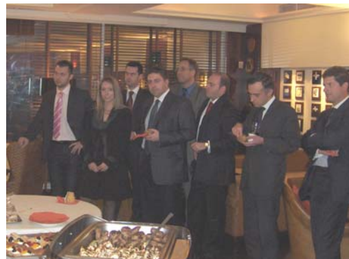
The LMT New Year event was hosted at the Piraeus Marine Club

LMT would like to thank once more all of its friends for their presence in the event and their productive cooperation in 2007, and to wish a fruitful collaboration in 2008, as well as prosperity and health in their personal lives.