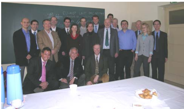
The EU-MOP project team at its final meeting at the Madrid Polytechnic campus, in front of a blackboard with everybody's signatures.