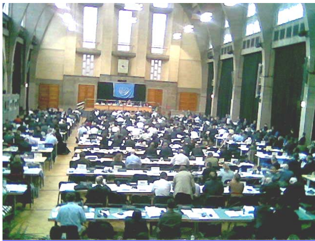
MEPC 57 in session at the Royal Horticultural Halls in London