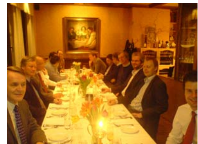
From the excellent dinner hosted by DNV in downtown Oslo

DNV and the National Technical University of Athens (NTUA) signed the strategic research & development collaboration agreement in Athens, Greece, on October 5, 2007.