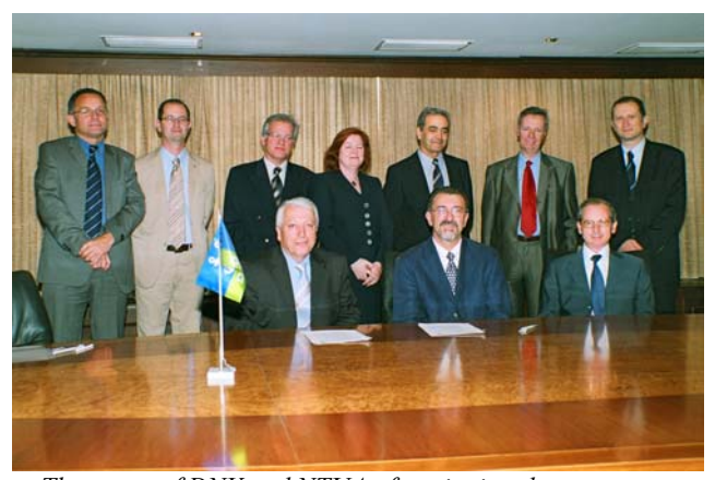
The teams of DNV and NTUA after signing the agreement

the School of Naval Architecture and Marine Engineering, will be the counterparts of DNV in this collaboration programme in the first 3 years starting in early 2008. The R&D collaboration will focus on effective bulk transportation (LMT) and ship design optimisation (SDL).