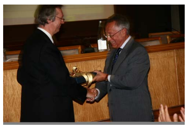
A gift to the Secretary General from LMT

SSE07 was under the auspices of The Hellenic Chamber of Shipping (NEE), the Hellenic Marine Environment Protection Association (HELMEPA), the Society of Naval Architects and Marine Engineers (SNAME), the International Association of Maritime Economists (IAME), the Women's International Shipping and Trading Association Hellas (WISTA Hellas) and the World Maritime University's Journal of Maritime Affairs, which will serve as an outlet for papers presented at the symposium.